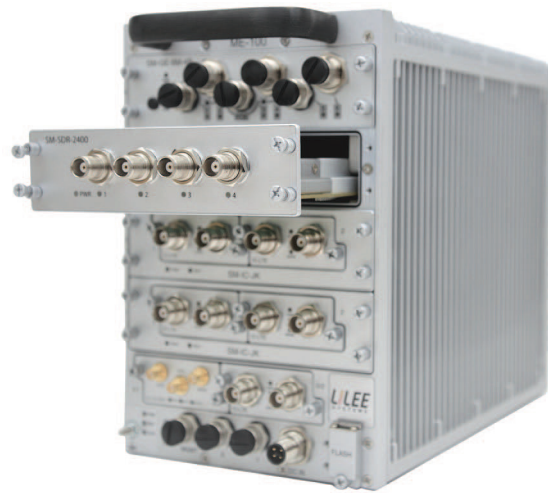
TransAir™ LMS-2450-ME-100 gateway