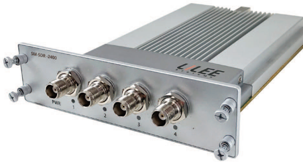
TransAir™ SDR-2400 interface card

Software-defined radio for ultra-reliable, low-latency communications